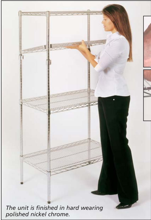
The unit is finished in hard wearing polished nickel chrome.