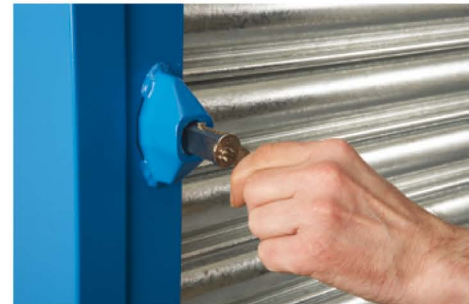
Heavy Duty Pin Locks